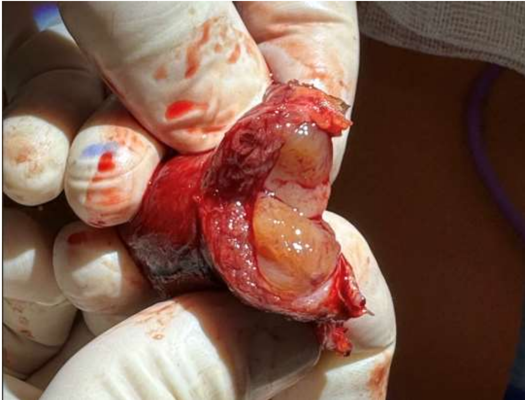
Intrathyroidal parathyroid adenoma